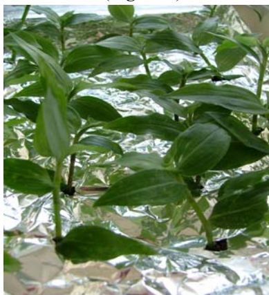
Figure 1. Aspects regarding the rooting method of Tradescantia sp. cuttings.

Noticing that Pi water and deuterium deleted water (25 ppm) had benefic effects to the germination process of wheat, corn and radish beans, we proposed to study their effects to the rooting of the cuttings. This is why we choose as vegetal study material apical Tradescantia sp. cuttings obtained from our university greenhouse, these having the following dimensions 3 cm length, 5 nodes and 3-4 leaflet, placing them in perlite only with basal node in substratum the second one being out of this. The perlite was placed in plastic material tray with the following dimensions 5/22/35 cm, over the tray being placed a transparent lid with two arched and slide walls with a 12 cm high, in the central area [16]. To avoid the mixing of both water types used to sprinkle the cuttings leaves and the rooting substratum we covered the perlite with a thin sheet of aluminum which was pierced to get out trough them the Tradescantia cuttings stems, the small orifices having 1 cm diameter ( Figure 1 ).